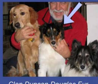
Clan Duncan Douglas Fur