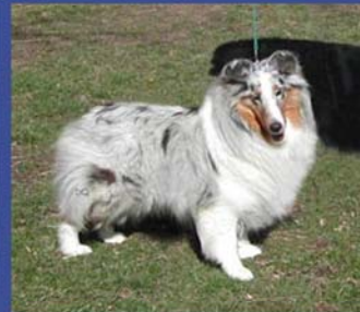
Clan Duncan Cherden New Moon