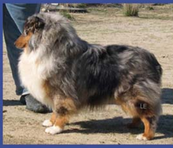
Clan Duncan Flying Clouds