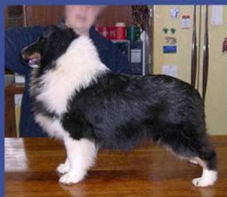
Clan Duncan Flashback