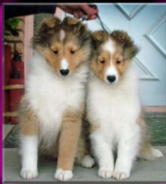
"Star" and "Bea"

By CH. Akadia Just Priceless ex BIS CH. Iona I Can Shine