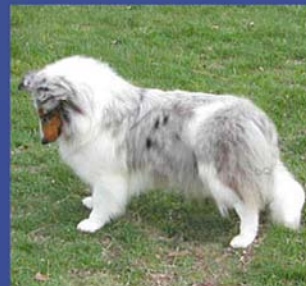
Clan Duncan Cherden Full Moon