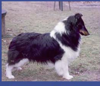
Clan Duncan Black Moon