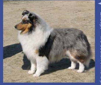
Int. Ch. Clan Duncan Blue Reverie