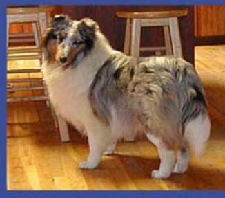
Clan Duncan Clearwater