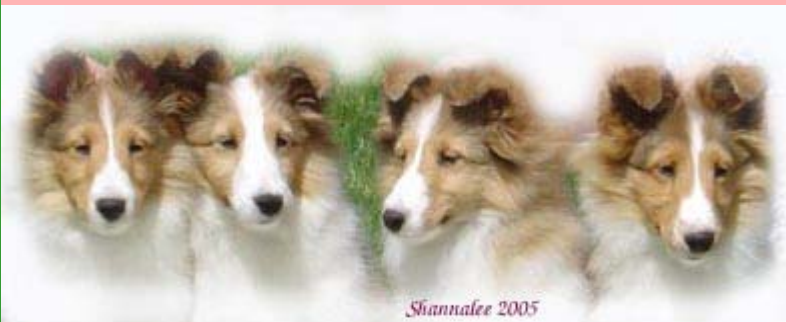
Pictured: CH. Iona Elle, CH. Iona Desirable, BIS CH. Iona I Can Shine and Iona Mona Lisa (pts). 3 Champions in one litter. Chilled semen breeding from Am/Jap Ch. Iona Rembrandt ex Kymric Kanata.

What titles do your dog's have? Off the top of my little brain I believe there have been seven "Iona" American champions and a few more that I have owned from someone else that have become American champion titled.