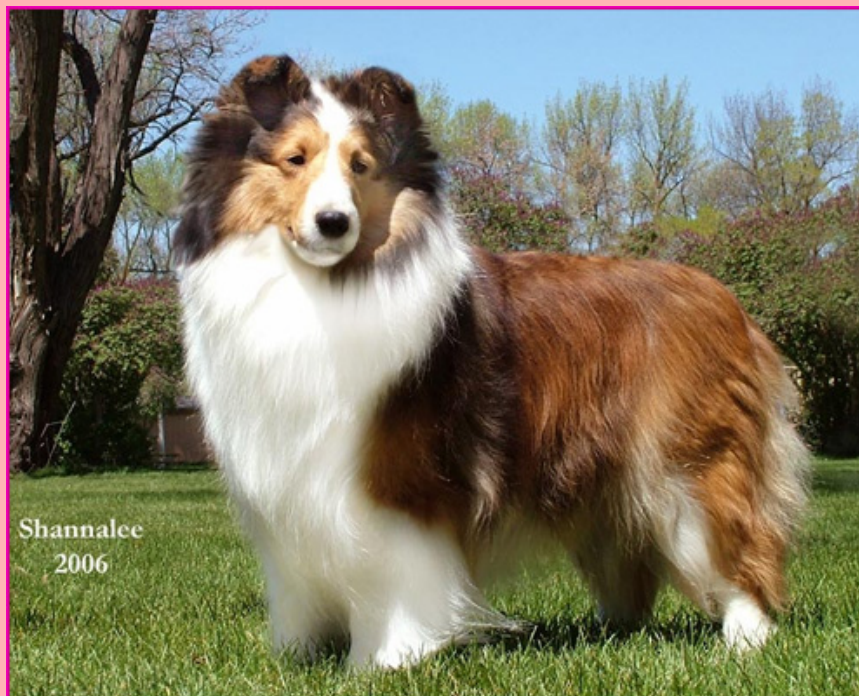
Kymric Kanata "Nattie", dam of 3 Champions in one litter!

mix for me :) Of course, my Nattie" Kymric Kanata, has been my foundation the past few years. She has really gave me some lovely champions , and we are hoping her daughter I have now, will make the number four champion for Nattie. Here is hoping for that last hopeful out of Nattie to make her an ROM!