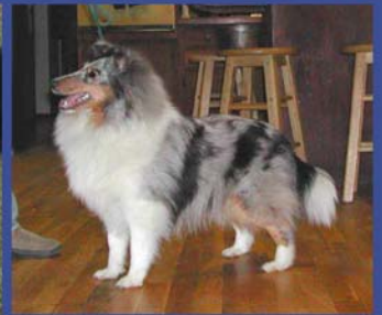
Royal Oaks Iris