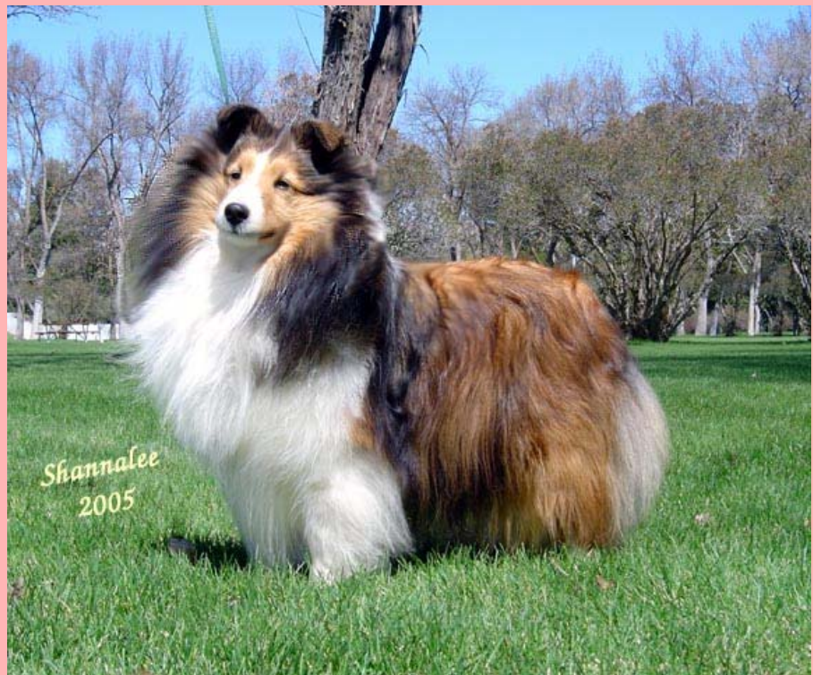
Ch. Iona Sequoya Strike A Pose "Shady",, dam of BISS Am/Jap Ch. Iona Rembrandt (7 Champions)

9) Who is your favorite dogs not owned by you (living or passed)? There are a lot of them :) but, off the top of my head I would say,, CH.