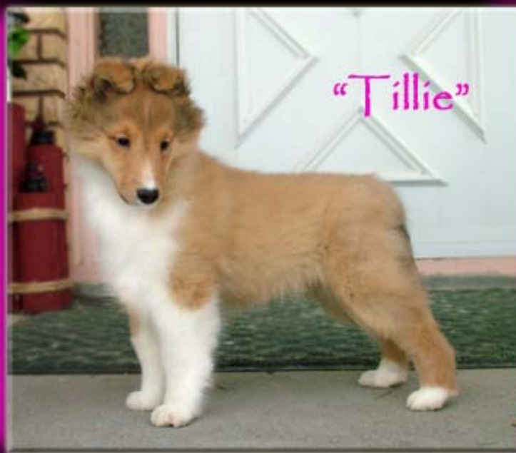
Akadia Making Spirits Bright by CH. Grandgables Lets Show Off ex UKC CH. Akadia Miss Congeniality