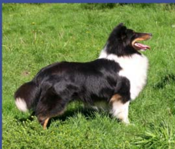
Cherden Clan Duncan Dark Moon