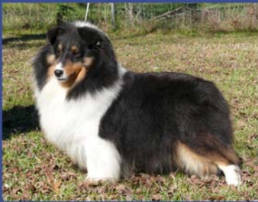
Clan Duncan Figurine